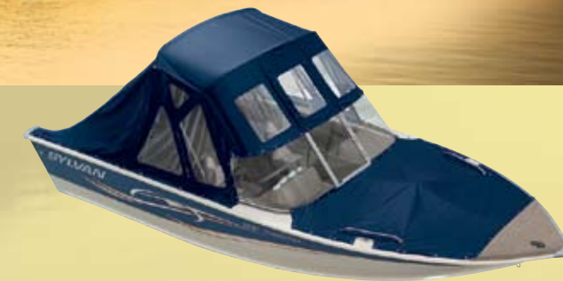
FISHERMAN'S TOP WITH AFT AND SIDE CURTAINS AND BOW COVER