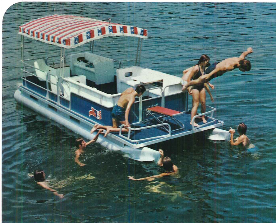
Table and furniture are standard equipment. Table painted white for photograph only; not standard.