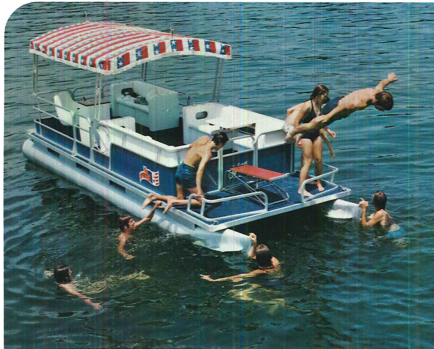
Table and furniture are standard equipment. Table painted white for photograph only; not standard.