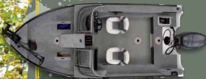
+ 1600 DC