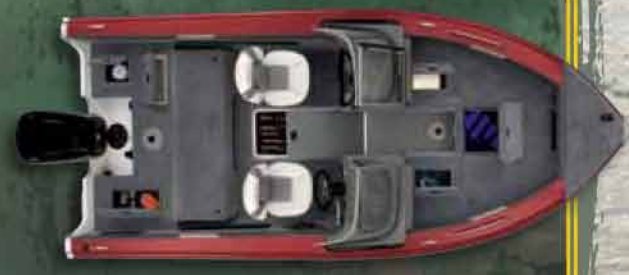
+ 1700 DC

All boats using OBs greater than 125 H.P. should have dual or hydraulic steering. Some models shown with optional equipment, including snap-in carpet, trolling motor and graph.