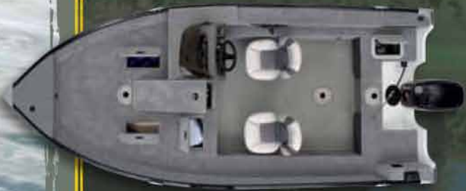
+ 1600 SC