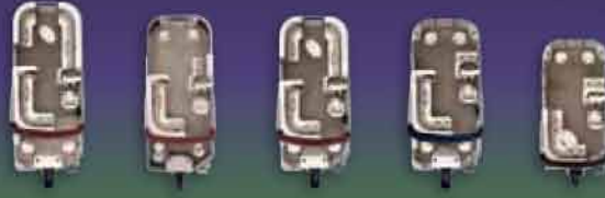
8522 F-N-C 8522 4-PT. 8520 F-N-C 8520 4-PT. 818 F