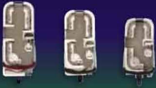
8522 C 8520 C 818 C