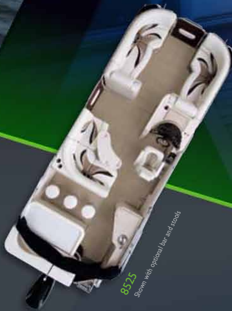
8525 Shown with optional bar and stools

Innovation meets luxury in the exclusive Mandalay series. You'll find every comfort and feature you've dreamed of in a pontoon — and more, with its awe-inspiring driver's console, impressive galley area and optional bar with stools. Add the optional RPT tube package, and you'll experience truly peerless performance.