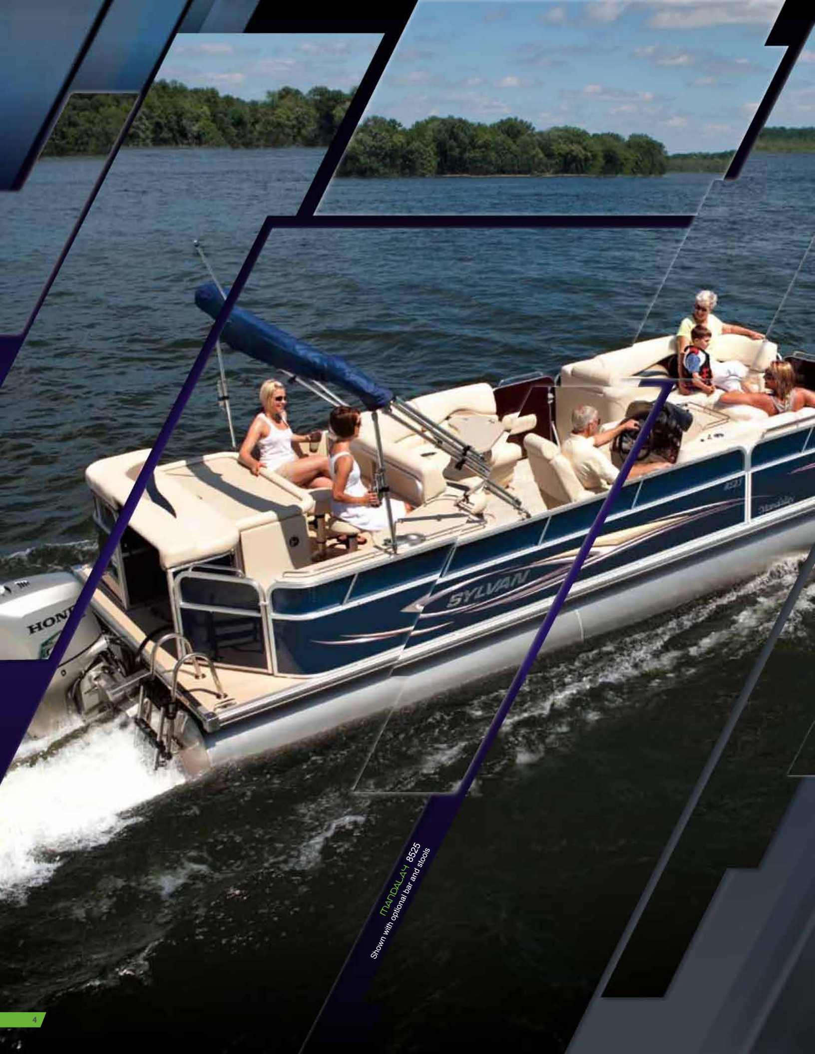
Mandalay 8625 Shown with optional bar and stools