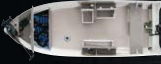
16' Super Snapper [SHOWN WITH OPTIONAL TROLLING MOTOR]