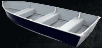
14' Sea Snapper [ALSO AVAILABLE IN SPLIT SEAT CONFIGURATION]