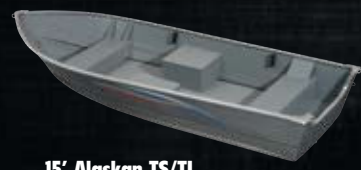
15' Alaskan TS/TL Split Seat DLX