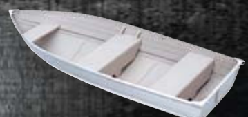
12' Sea Breeze