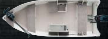
14' Super Snapper [SHOWN WITH OPTIONAL TROLLING MOTOR]