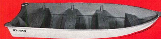
14' SEA SNAPPER