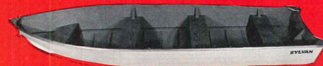
16' SEA SNAPPER