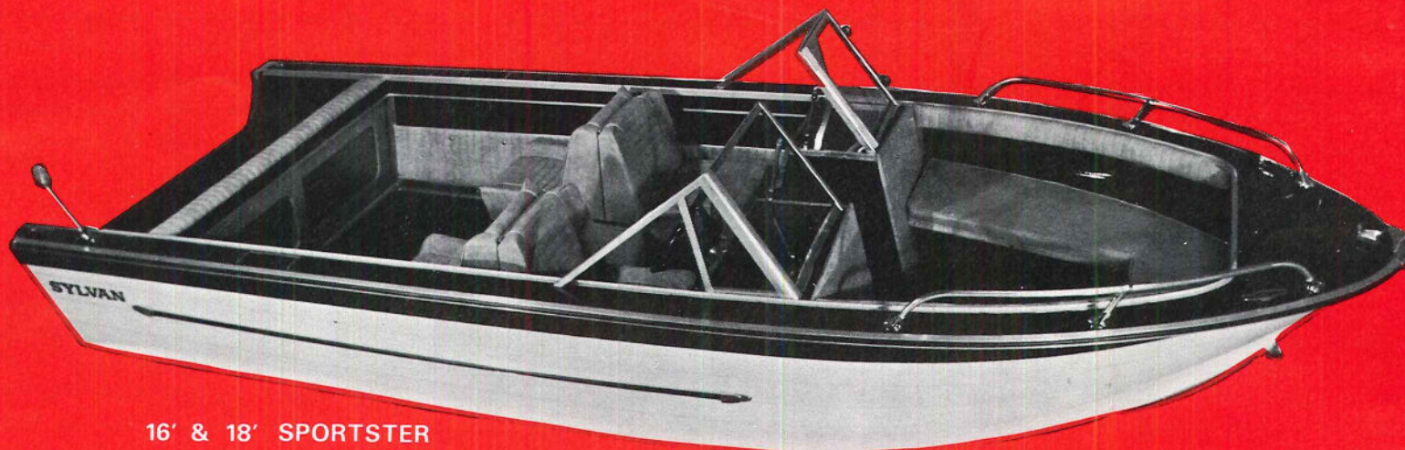
16' & 18' SPORTSTER