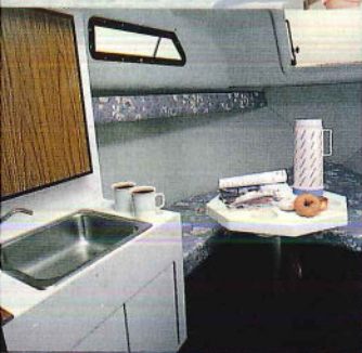
Spacious cabin interior.