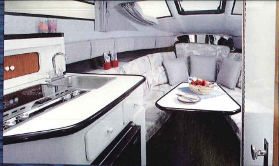
Relax in luxurious comfort.