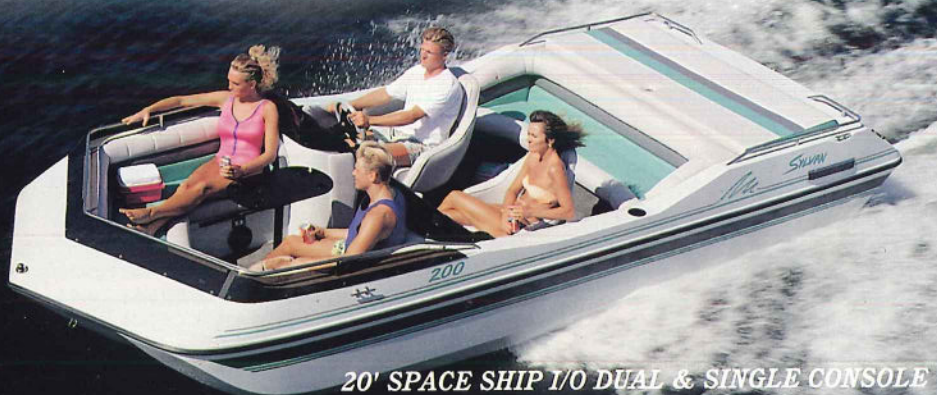
20' SPACE SHIP I/O DUAL & SINGLE CONSOLE