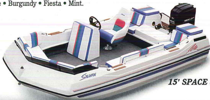
15' SPACE SHIP O.B.

Colors: Blue • Burgundy • Fiesta • Mint.