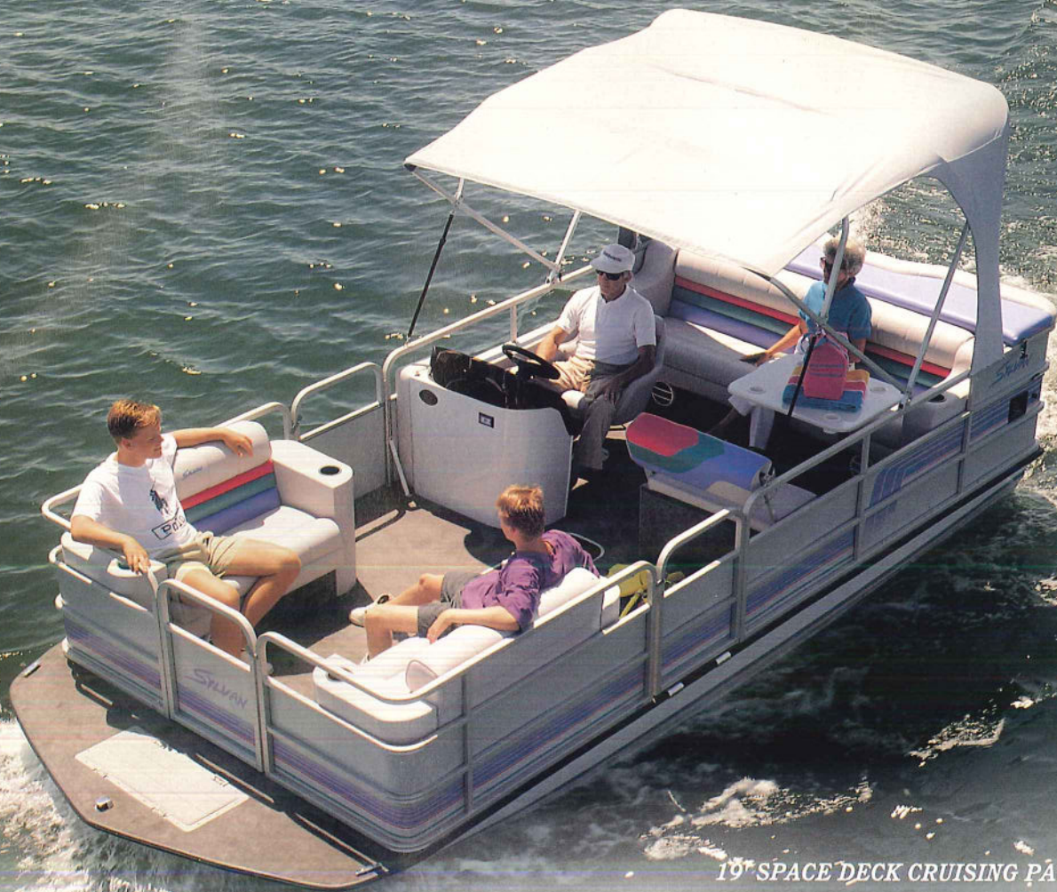
19' SPACE DECK CRUISING PACKAGE O.B.