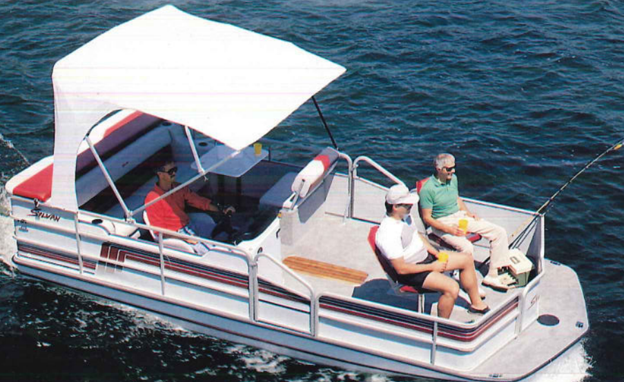
19' SPACE DECK FISHING PACKAGE O.B.