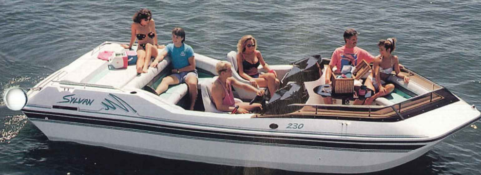
23' SPACE SHIP I/O