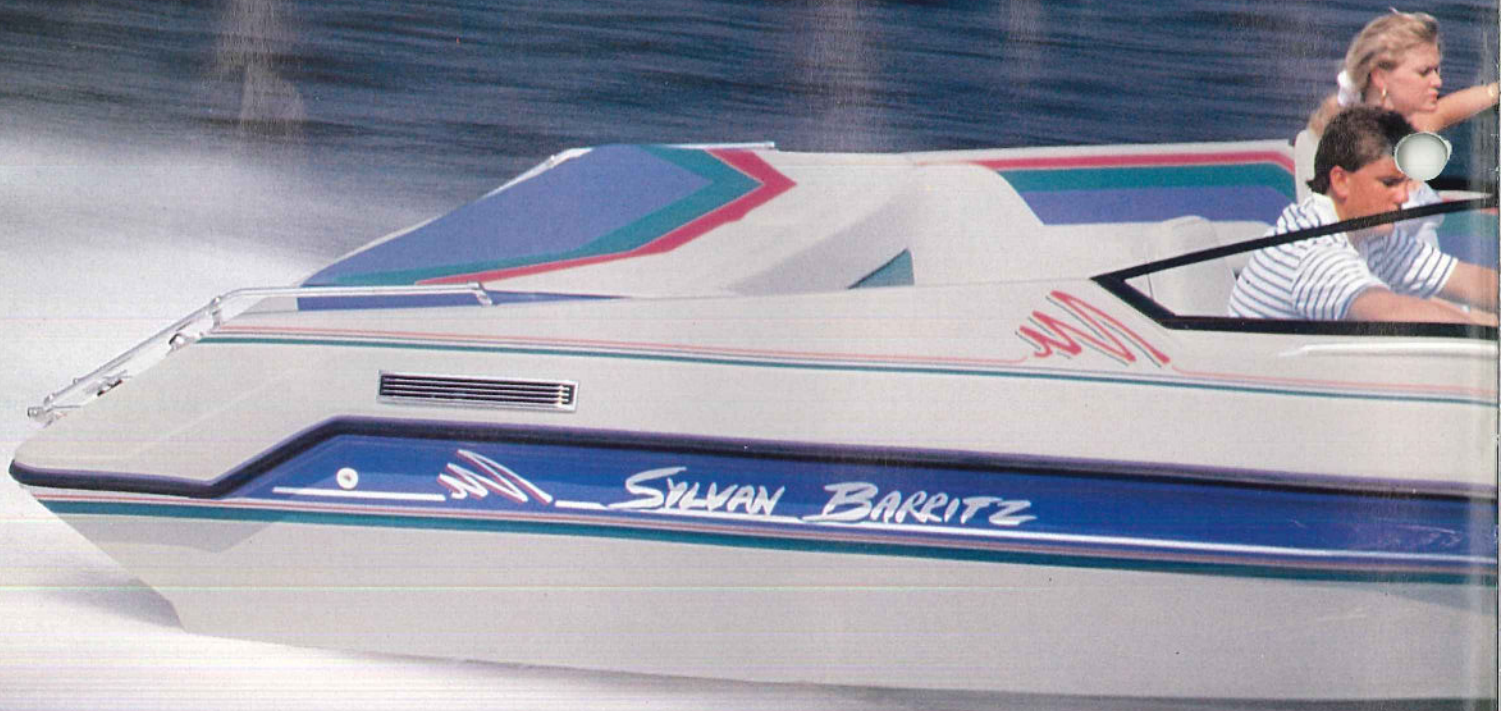
V209 SPORT I/O